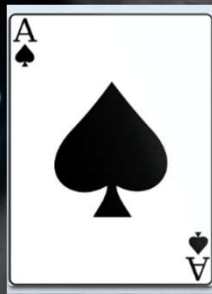
CARDS OF ILLUMINATION