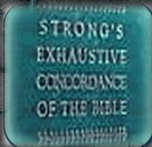
STRONGS BIBLE CONCORDANCE